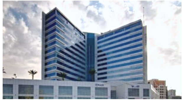
IT PLAZA OFFICES, OASIS CENTER