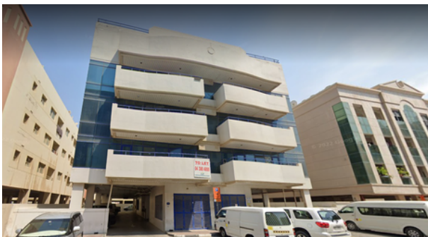
AL BAYAN BUILDING MANKHOL, DUBAI