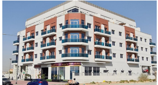
WARSAN AVENUE IN WARSAN, DUBAI