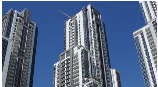
J TOWER, BUSINESS BAY, DUBAI