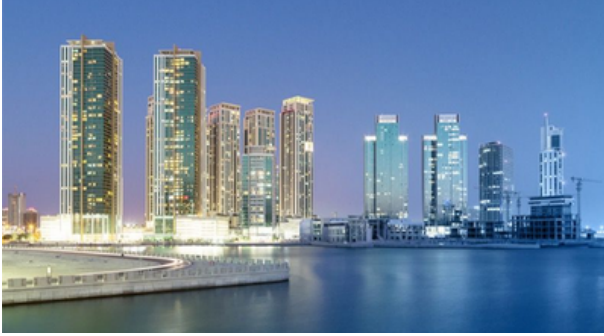
MARINA SQUARE, ABU DHABI