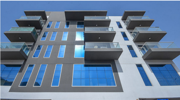
MIRDIF BUILDING IN MIRDIF, DUBAI