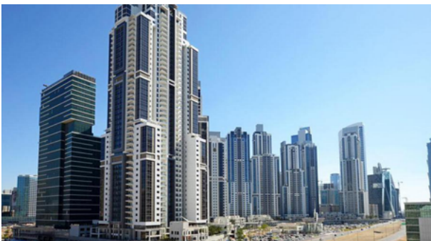
E TOWER, BUSINESS BAY, DUBAI