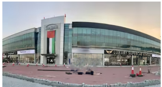
THE CURVE BUILDING, SZR, DUBAI