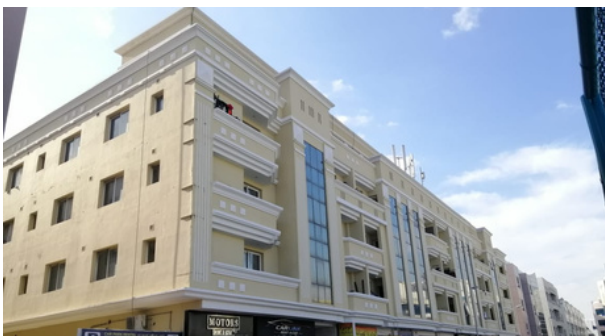
AL MAHA CENTRE, ABU HAIL, DUBAI