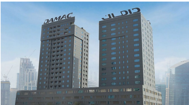
CAPITAL BAY, DAMAC