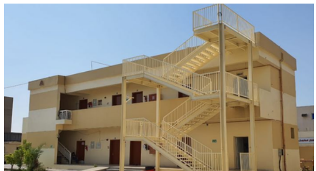
MUSAFFAH BUILDING, ABU DHABI