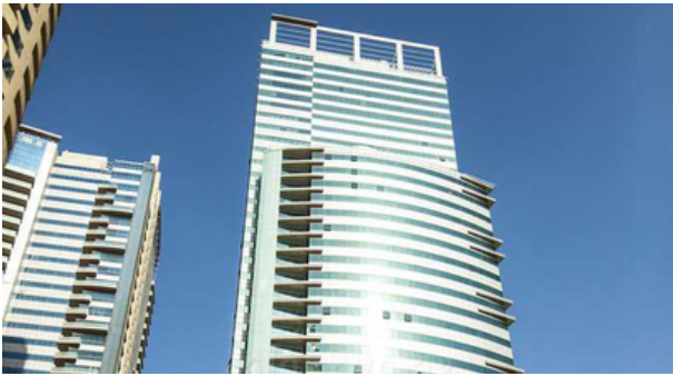
1 LAKE PLAZA OFFICES, JLT, DUBAI