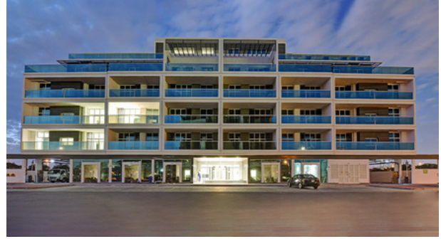
GOLDOLPHIN AVENUE MEYDAN